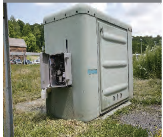
RS-3314 Monitoring Lift Station

Information is stored for archival use in the Enterprise SQL database to share with other applications (e.g. SCADA, modeling, billing) and made available to users in report format or graphical presentations on a web site.