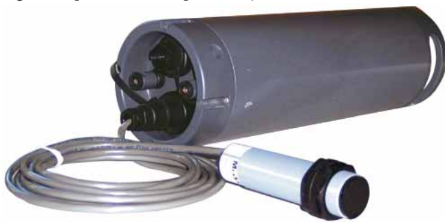
A "typical" battery powered, wireless RTU intended for harsh environments, shown here with an ultrasonic level sensor.

The typical SCADA system approach to improve data integrity for remote monitoring is redundancy. The thinking is that by adding redundant communications channels, computers and fault tolerant computer drives, system reliability is improved. This is true of course, but the user ends up purchasing two expensive data acquisition systems instead of one.